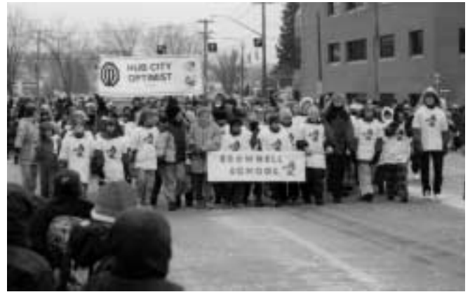
JSN Clubs participating in the Santa Clause Parade

PLEA has worked hard to build a central resource library for JSN materials including books, educational videos, activity kits, games and workbooks.