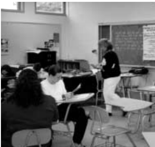
Participants during a session of the Youth for Human Rights conference

PLEA helped coordinate the first annual Youth for Human Rights Conference held at Walter Murray Collegiate April 15-17, 1998. Eight workshops were offered for young people dealing with various aspects of human rights education. There was no cost to the participants as a number of sponsors assisted in making the conference possible. A 1999 conference was overwhelmingly endorsed.