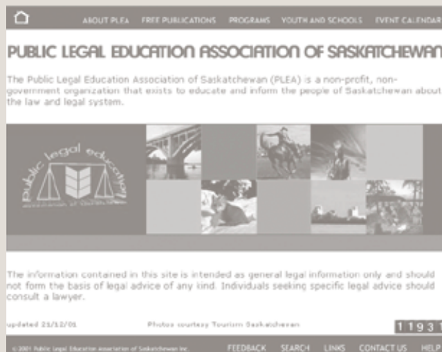
The redesigned look of the PLEA website