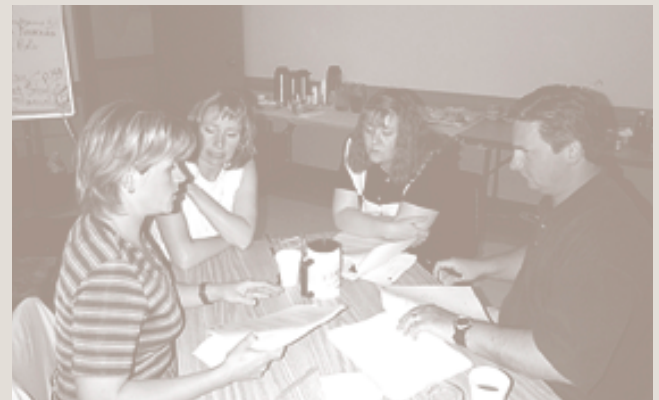
League of Peaceful Schools Peer Mediation Workshop in Humboldt