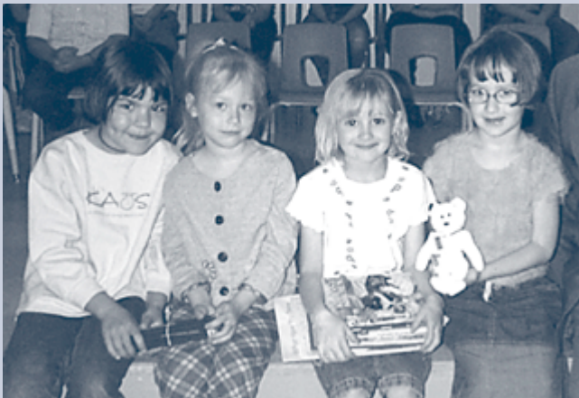
Some students from Brock Elementary School who are happy to be part of the League of Peaceful Schools

For all of this, we would like to thank our Board of Directors for providing us with leadership and for the confidence they have shown our administration. We would like to thank our volunteers for providing their time and for the commitment to citizenship they have made by sharing their expertise. We would like to thank the Law Foundation of Saskatchewan for providing us with the financial tools to carry out our mission and for the support they have demonstrated for our organization. Most of all, we would like to thank our staff for providing the talent to help us achieve our goals and for the dedication they have shown to PLEA.